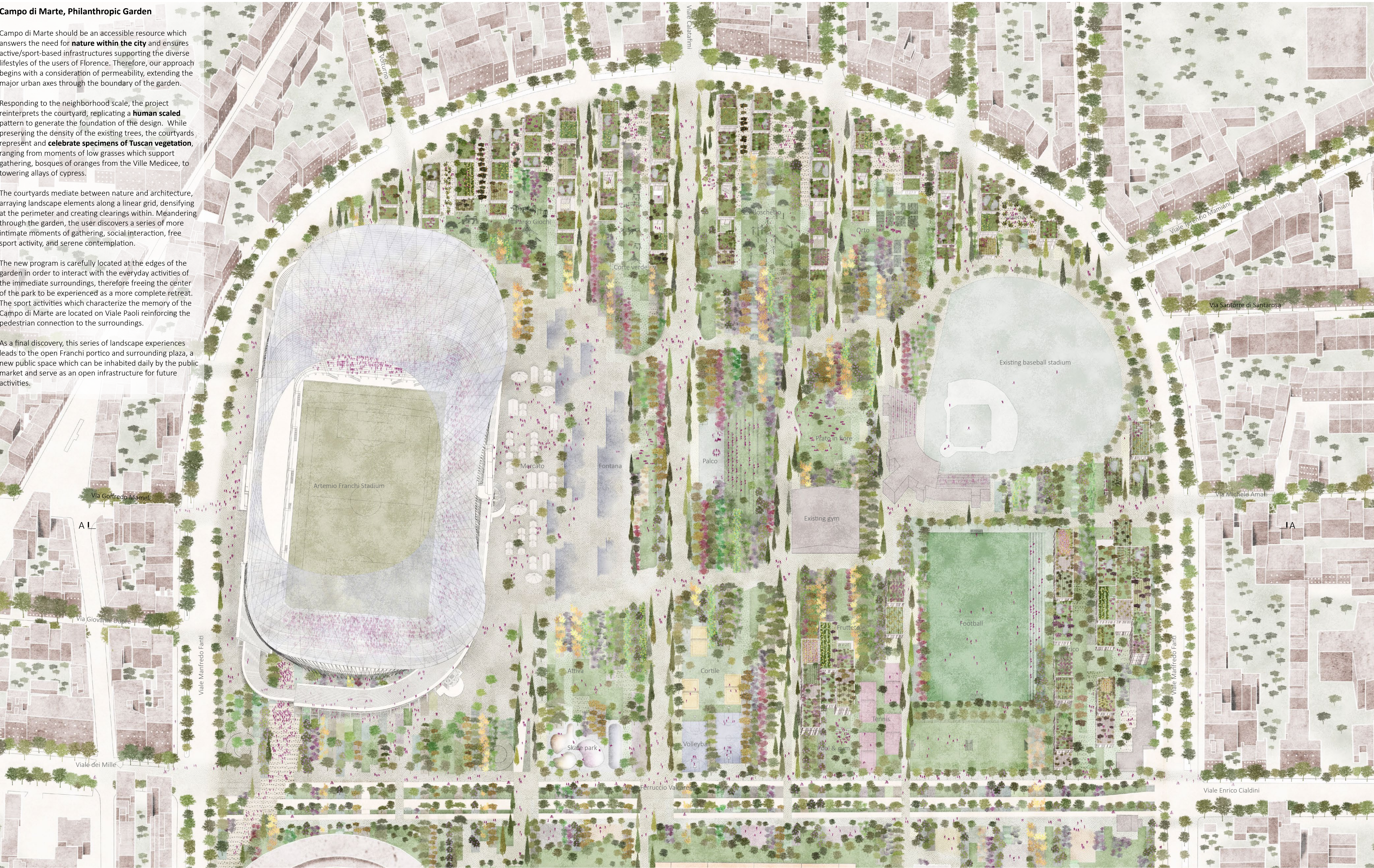
URBAN GARDEN | Il Giardino di Campo di Marte

As a final discovery, this series of landscape experiences leads to the open Franchi portico and surrounding plaza, a new public space which can be inhabited daily by the public market and serve as an open infrastructure for future activities.