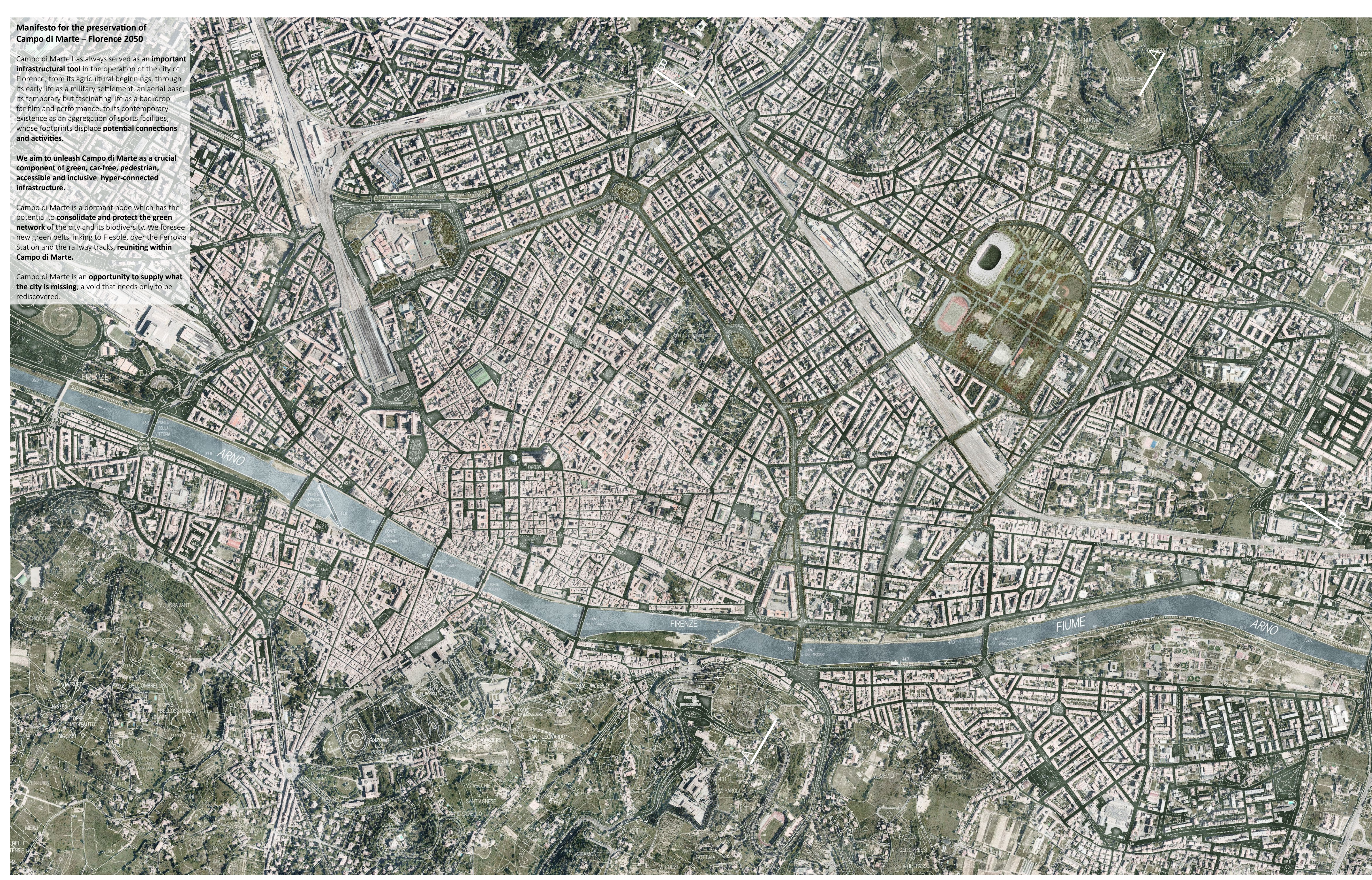
CAMPO DI MARTE 2026 | Nevralgic Green Infrastructure